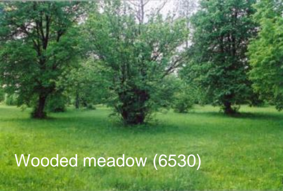
Wooded meadow (6530)