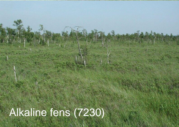
Alkaline fens (7230)