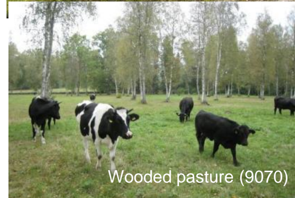
Wooded pasture (9070)