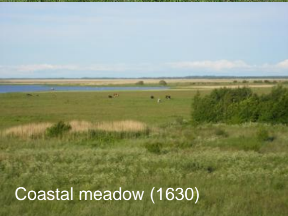
Coastal meadow (1630)