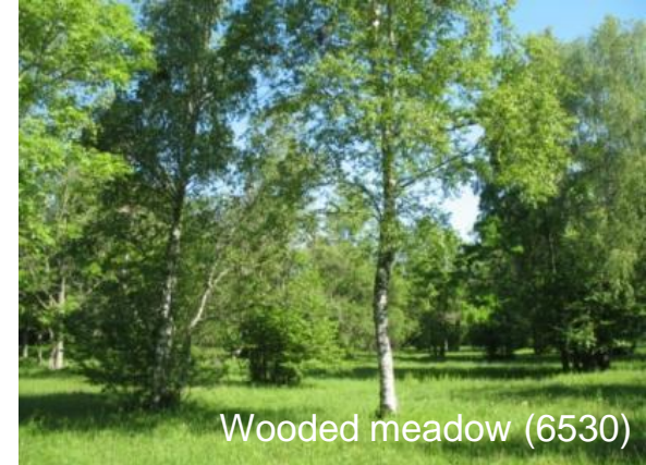
Wooded meadow (6530)