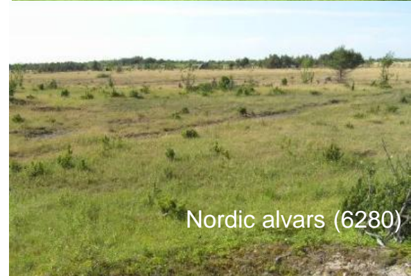
Nordic alvars (6280)