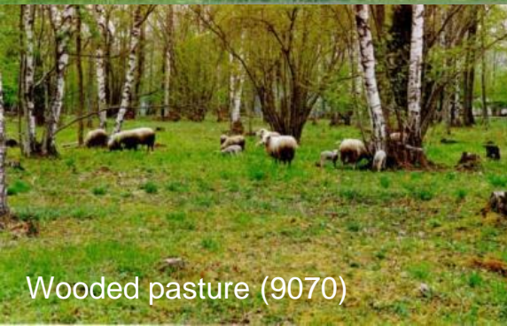
Wooded pasture (9070)