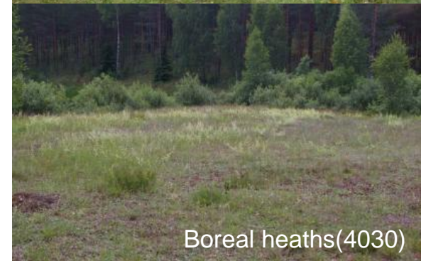
Boreal heaths (4030)