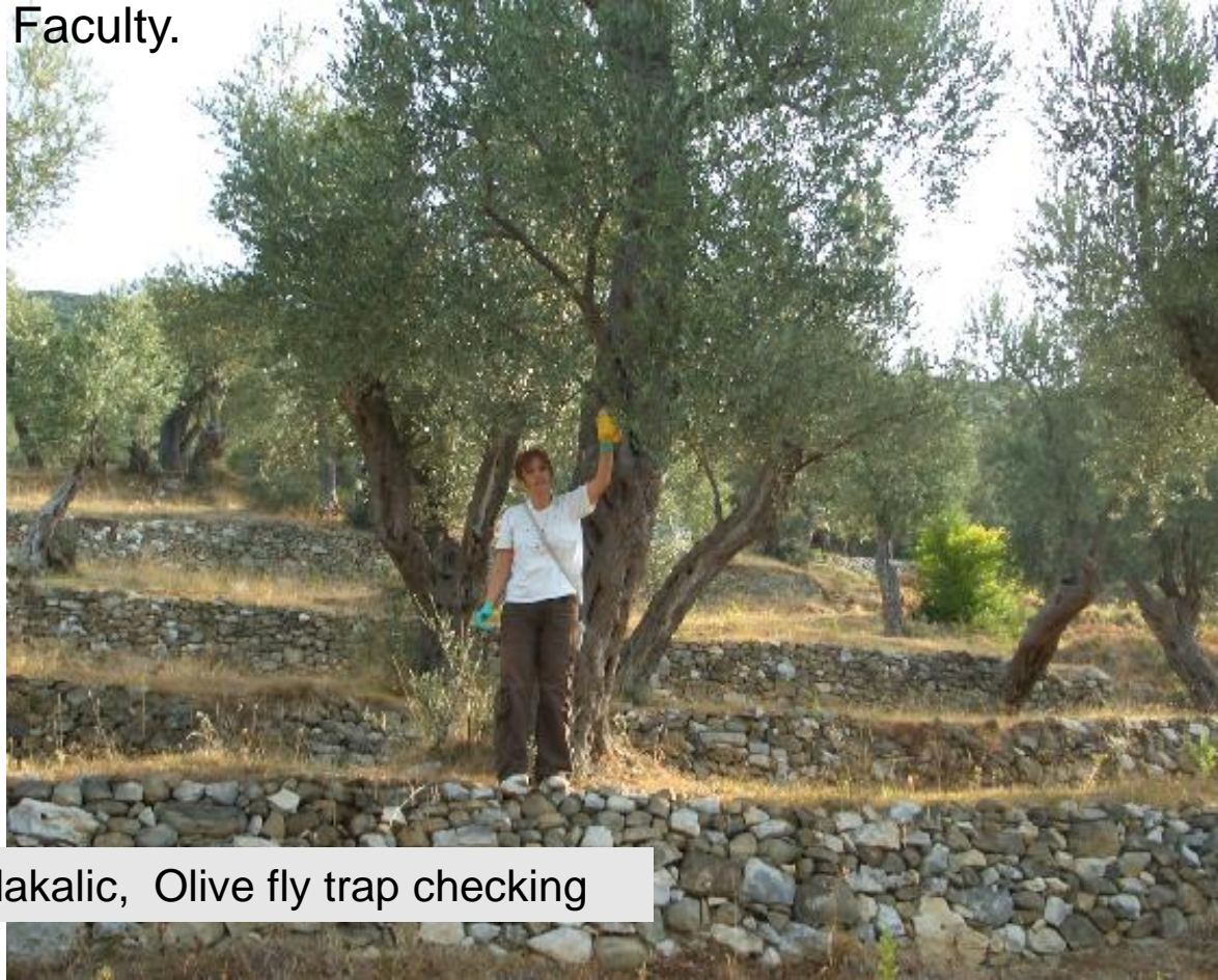
Olive fly trap checking