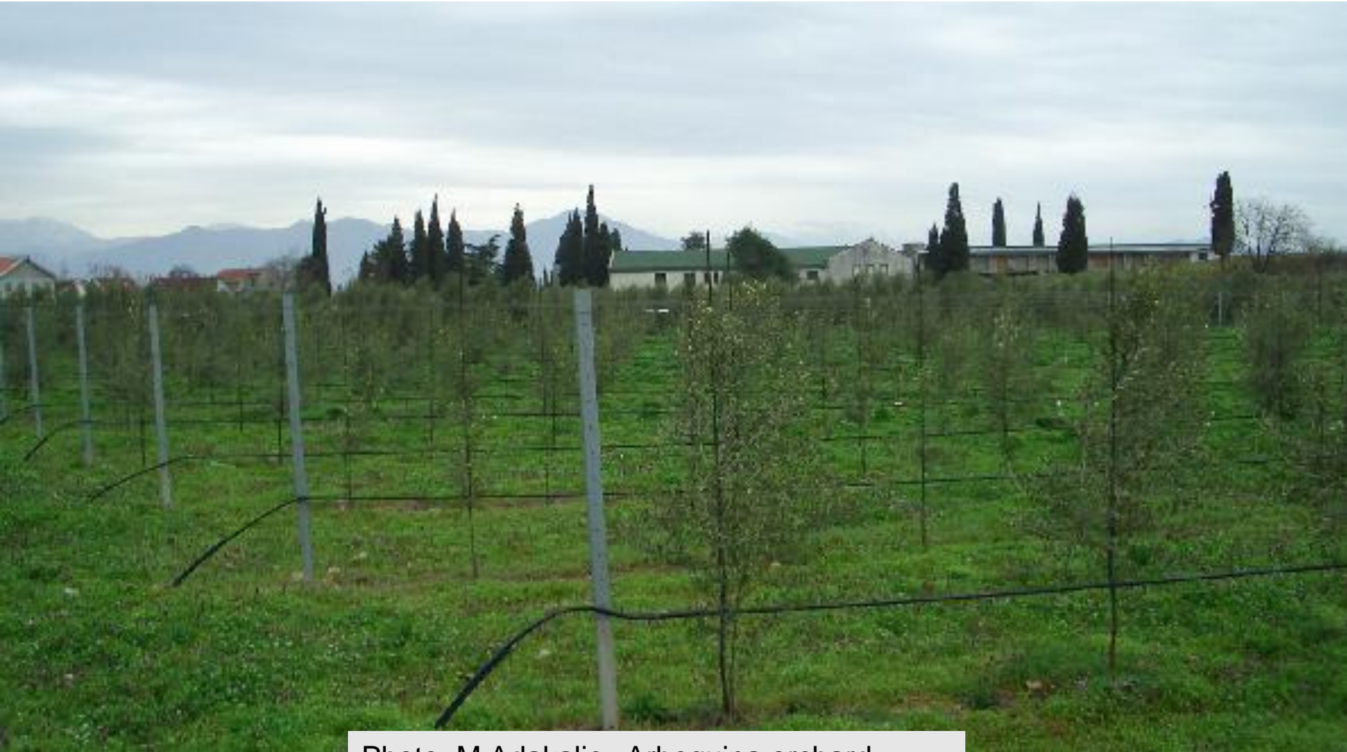
Arbequina orchard

Intensive olive growing - 1ha with Arbequina variety planted in 2006 in Podgorica by 'Plantaze' – a vine-growing company