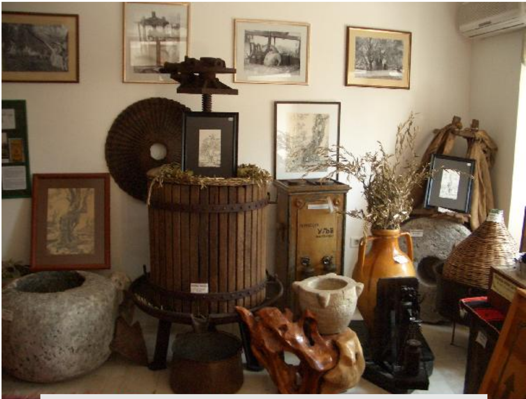
Detail from the 'House of olive' in the Old City of Bar